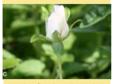
c- Leaflet tipped sepals