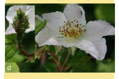
d - cristata sepals