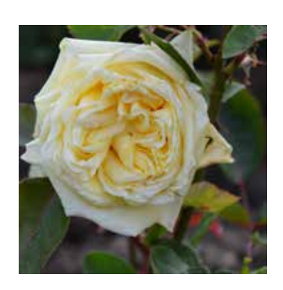
'Souvenir de Pierre Notting'

Three hundred workers and growers were employed in Luxembourg rose cultivation at that time. In the northern part of the Grand Duchy, Soupert & Notting grew the wild root stock. In the villages, around the city of Luxembourg, were the many rose fields where the farmers grew roses for the nursery. As well as working in the fields, the employees grafted roses and were responsible for dispatching them. Jean Soupert and Pierre Notting were very inventive. For the long journeys to America and Brazil, they created special baskets made of willow branches ( Salix ), in which the roses were transported in humid conditions without rotting.