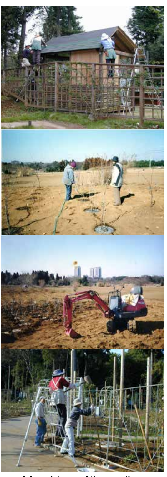
A few pictures of the countless volunteers who worked on both gardens.

The roses in the garden were growing beautifully; the numbers of the species and varieties were increasing; and the supporters of our work were on the rise. And we knew then The Rose Garden Alba was not large enough to carry out our original projects or to introduce new schemes. With many meetings lasting late into the night, we arrived at the outline of an ideal rose garden, and using various data we had collected, started negotiations with several local government offices and developers to find partners to support our project. Finally, we started to negotiate with our city Sakura to solicit its cooperation with our project, and in 2003 a plan was approved to open a new rose garden with the cooperation of Sakura City and the Rose Culture Institute. The 1,800 rose plants of 800 different species and varieties we had so far collected, and as many as 9,000 items of rose-related books and documents collected by Mr. Suzuki, were all donated to the city from the Rose Culture Besides the roses, the constructions Institute. in the Rose Garden Alba were also all donated to the city, and the garden was closed in 2004.