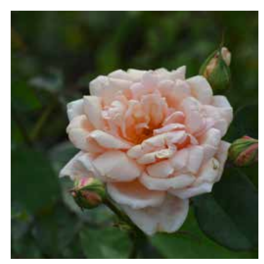
'Mme Jules Gravereaux'