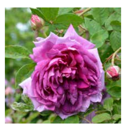
Above: 'Tour de Malakoff'

Their second creation, a pink rose, also from 1856, was called 'La Noblesse'. Soupert & Notting were not only exceptional rose breeders, but also marketing geniuses. At that time, it was the aristocracy and the upper-class who regularly bought roses for their parks and gardens, not the common people. After a year in business, Soupert & Notting published their first catalogue which included 450 different rose varieties. Soupert & Notting had excellent contacts with the