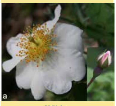
a - Wild type