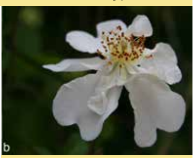
b - Semi-double (2nd generation from x pervirens 'flore pleno')