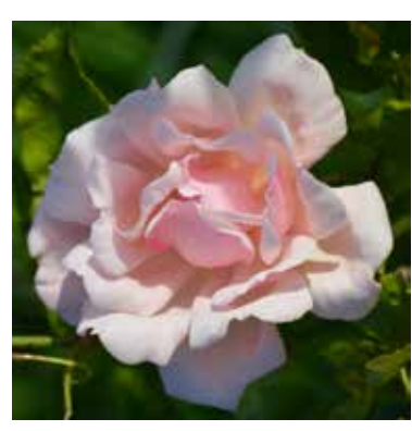
'Vicomte Maurice de Melon'