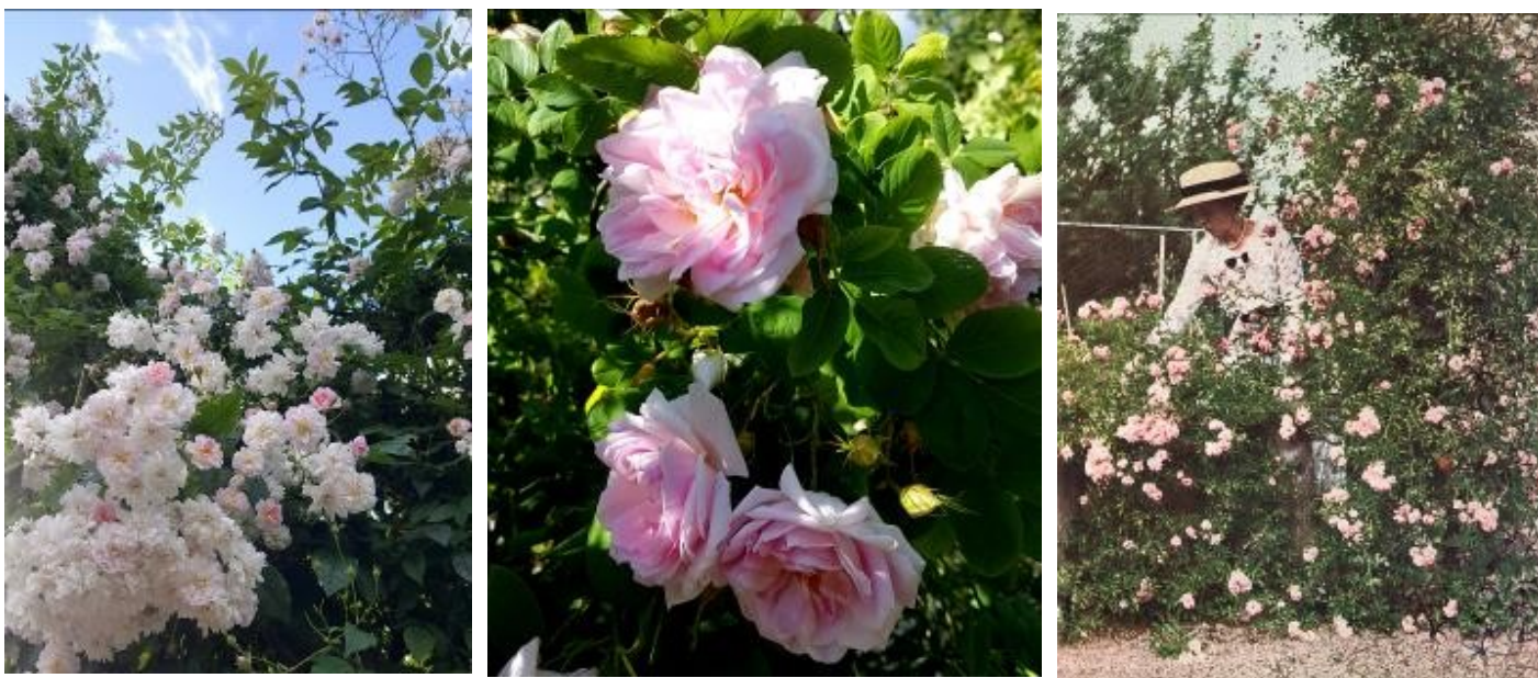
From left: 'Paul's Himalayan Musk' against the blue sky at Rosenlund in Jönköping, Rosa alba 'Minette' which is still growing in the garden of Karin and Carl Larsson, Crown Princess Margareta in one of her rose borders at Sofiero in Helsingborg.

A person who had a great impact when it came to both garden fashion and interior design ideals at this time was Karin Larsson, wife of the famous artist Carl-Larsson. In the couple's garden in Dalarna in northern Sweden, Karin grew Alba roses around 1890, but she also challenged the cold climate by trying the latest hybrid teas from France. She and Carl had lived in France for some years, and they were influenced by French gardening and of course by French cuisine. In her kitchen garden Karin grew spinach, tomatoes, asparagus and artichokes. In her flowerbeds she tried 'Mme Caroline Testout' and also the latest scented paeony, 'Sara Bernhardt' amongst lots of Swedish wildflowers.