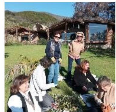
Above: Rosaleda del Parque Araucano, From left: Ladies in their rose aprons, pruning in the park, preparing cuttings for propagation