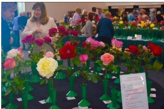
Left: Friends dinner, Right: Adelaide Rose Show