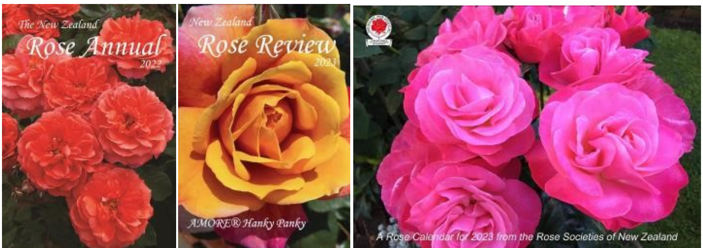
New Zealand publications: Left: 2022 Annual, Middle 2023 Rose Review, and Right: 2023 Calendar