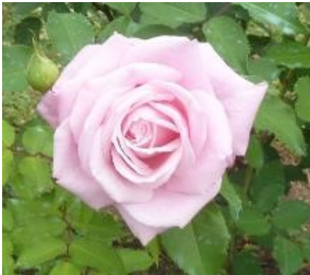
'Belinda's Dream' (1992, S)