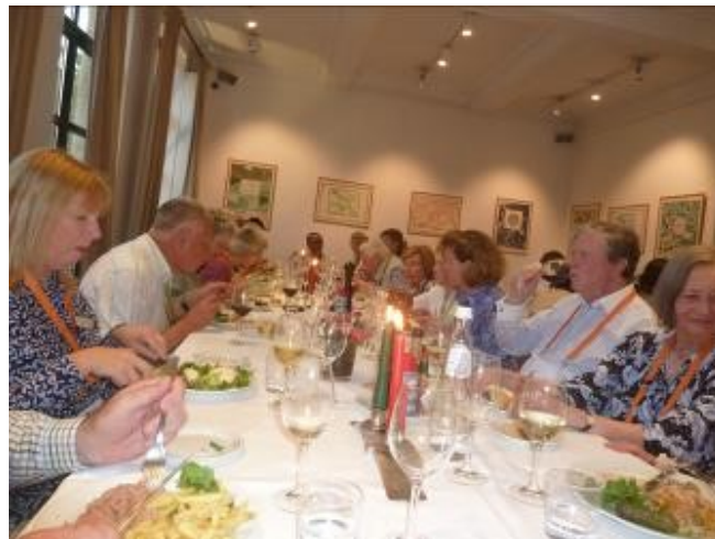
Left: Friends Dinner at Au Vieux St Martin Restaurant, Brussels, Belgium