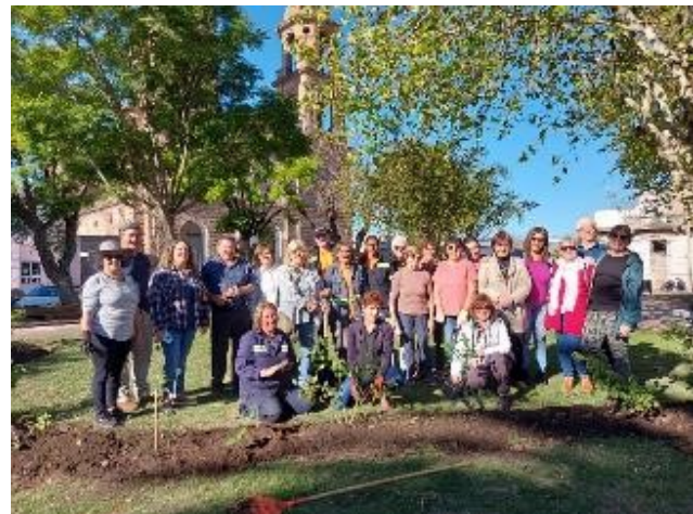
Above: Dolores authorities, members of AUR Oeste Branch and locals planting 'Rosa de la Plaza de Dolores'