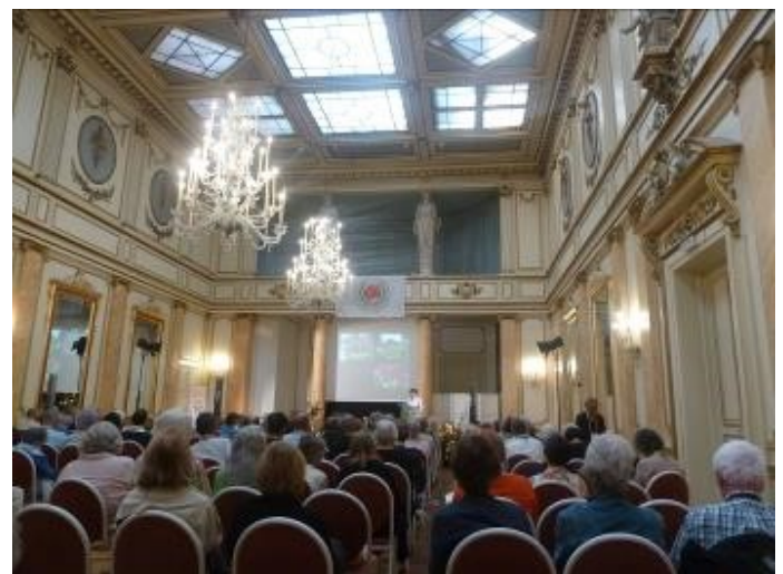
Left: Cercle Gaulois, Right: Lecture Hall